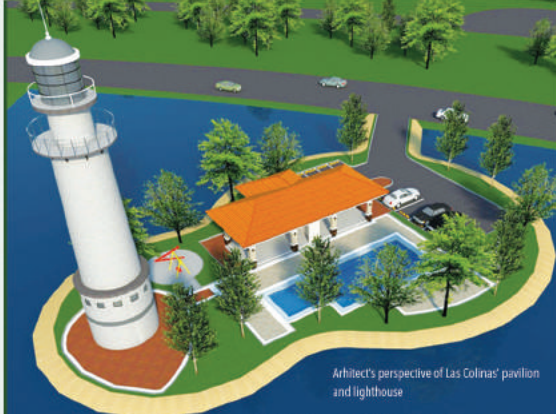
Architect's perspective of Las Colinas' pavilion and lighthouse